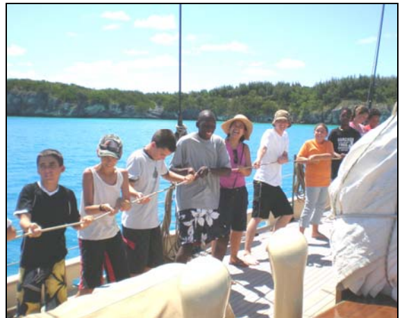
BioNauts raising sail on sloop

In addition to working on the curriculum, she prepared a new report on the BioNauts that has become an on-going program component and created an online photo display to recruit and inform prospective Explorer students and enhance publicity and fundraising.